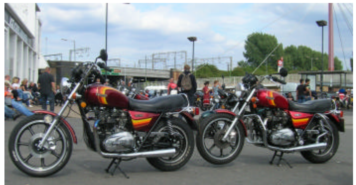
VMCC day at the Ace Café – a rare sight, two TSXs together, on the left is Erum Waheed's.

The true identity of Prince Charming here can be accurately guessed from the empty beer barrels behind.